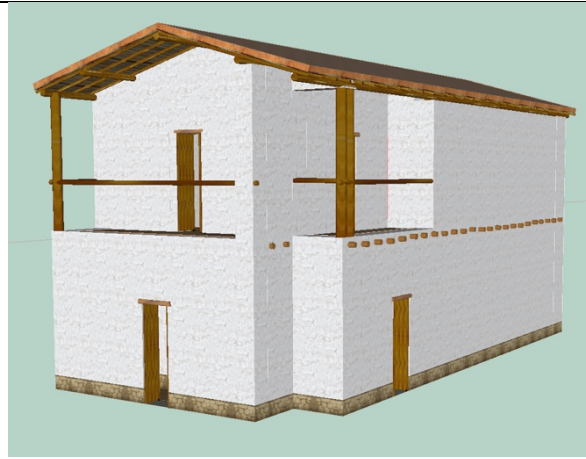
Modelled Corridor House in SketchUp